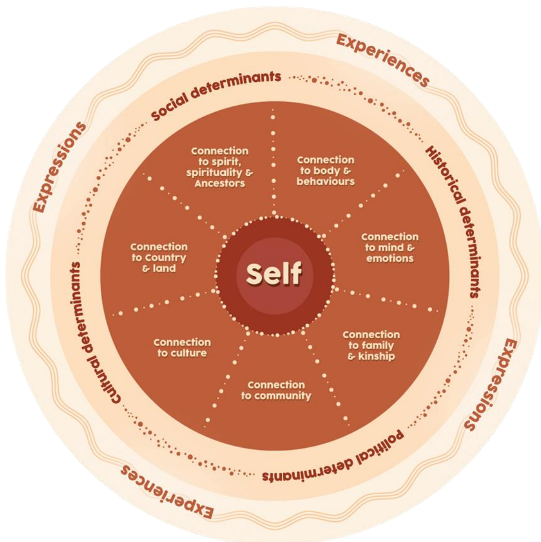
Figure 1: Social and Emotional Wellbeing adapted from Gee et al. 2014

Finally, several Aboriginal psychologists from the Australia Indigenous Psychologists Associations further developed the model of SEWB (shown in Figure 1 below) produced an important paper (Gee et al. 2014) which now underpins numerous frameworks, strategies and programs, including The National Strategic Framework for Aboriginal and Torres Strait Islander Peoples' Mental Health and Social and Emotional Wellbeing 2017-2023 (previously established in 2004-2009) and a range of other frameworks and strategies (see Dudgeon et al, 2021; Dudgeon, et al, 2014). Currently, SEWB is embedded in policy across a range of areas and the definitions cited above remain central.